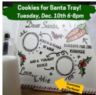
Cookies for Santa Tray: Paint N' Sip $80.00