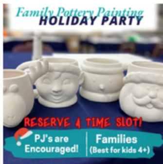
Family Pottery Painting Holiday Party $10.00

724-473-0223 • curio@curiocol.com • 113 North Main Street, Zelienople, PA 16063