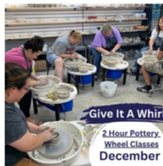
Give It A Whirl December (Ages 16+) $60.00