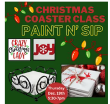
Christmas Coaster Paint n' Sip (Ages 18+) $45.00