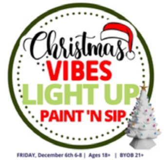
Christmas Vibes Light Up Pottery Paint N' Sip (Ages 18+) from $10.00