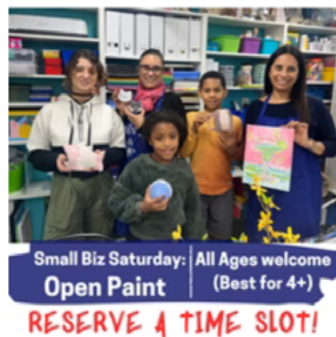
Small Business Saturday Open Paint Reservations $10.00