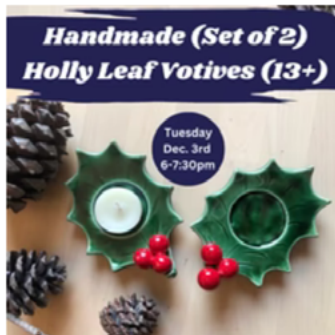
Handmade Holly Leaf Votive (Ages 13+) $45.00