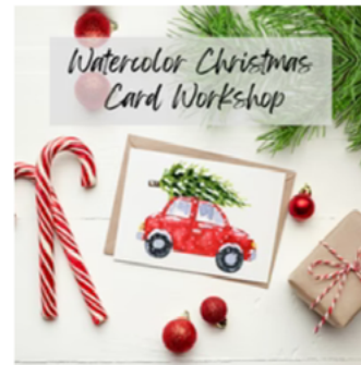
Watercolor Christmas Truck Painting/Card workshop (Age 12+) $25.00